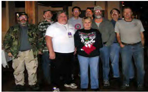
Christmas Parade Volunteers